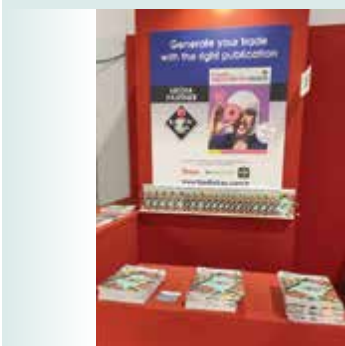
Ipack Ima Italy